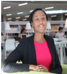
Pr Jessie Pallud Université de Strasbourg (EMS)