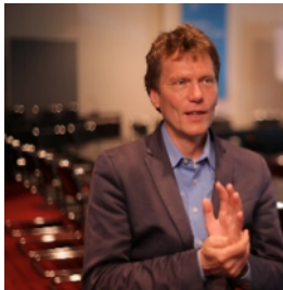
Pr Hartmut Rosa Friedrich-Schiller-Universität