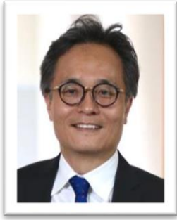
Youngjin Yoo Case Western Reserve University Keynote speaker OAP 2024